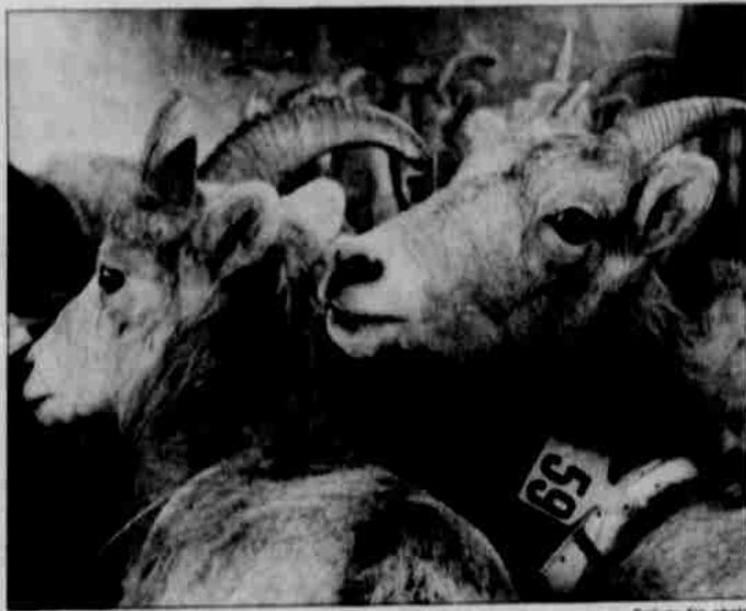
The animals wear radio collars, so Natural Resources can track their location.

"I talked to the wildlife biologist at The Dalles, and they're