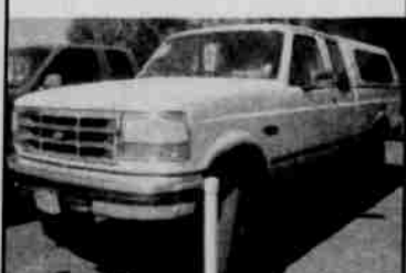
Ford F250 4x4, X-Cab

Many other models to choose from. Stop and take a look!