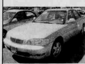
96 Acura 2.5 TL