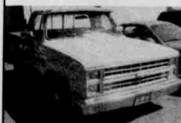
85 Chevy Silverado Pick Up