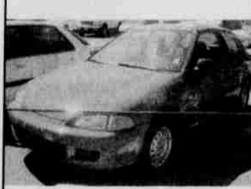
94 Honda Civic DX