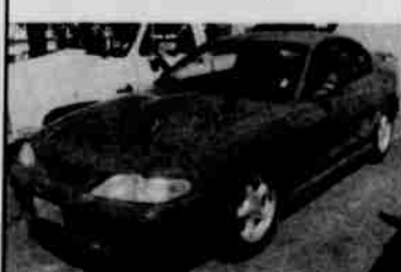
95 Ford Mustang