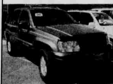
00 Jeep Grand Cherokee