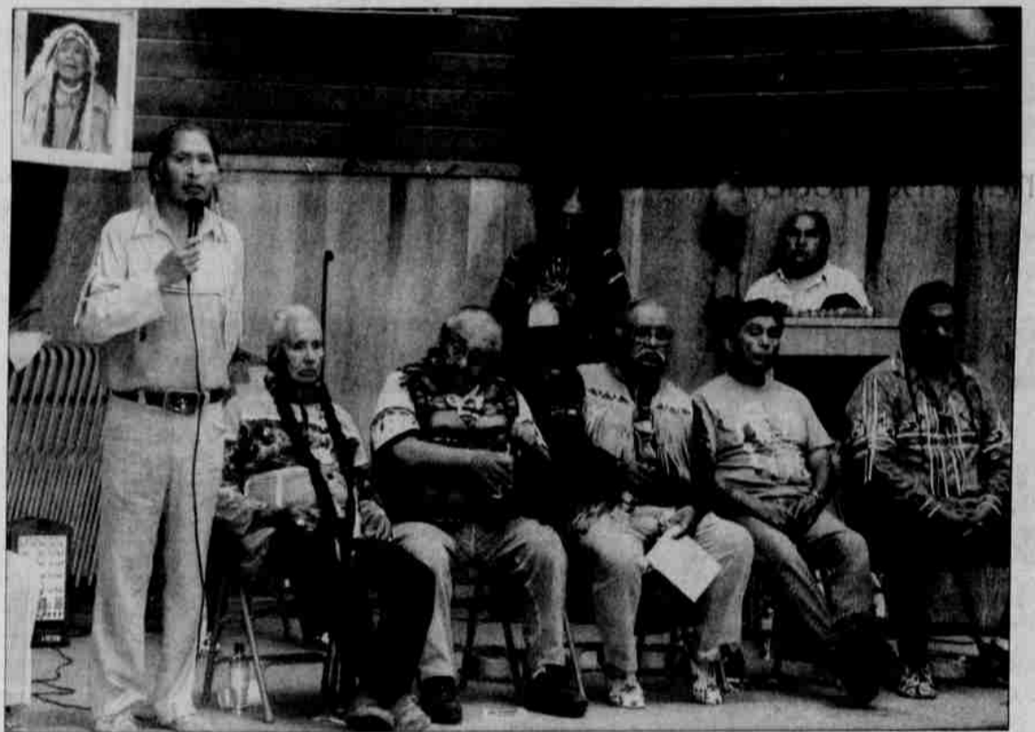
Representatives of the Columbia River tribes were on hand.

Indians of the Columbia River tribes gathered on July 23 for the opening and blessing of the new Celilo Wy-Am Longhouse. The building is beautiful to look at and the people of Celilo are very