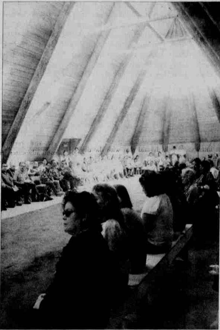
View of the inside of the longhouse, during the dedication ceremony.