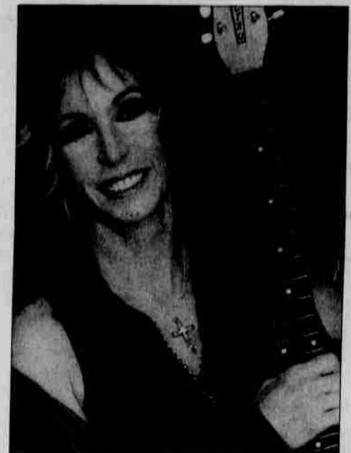
Juice Newton will perform at the fair at 9 p.m. on Friday, July 29, on the Les Schwab stage.