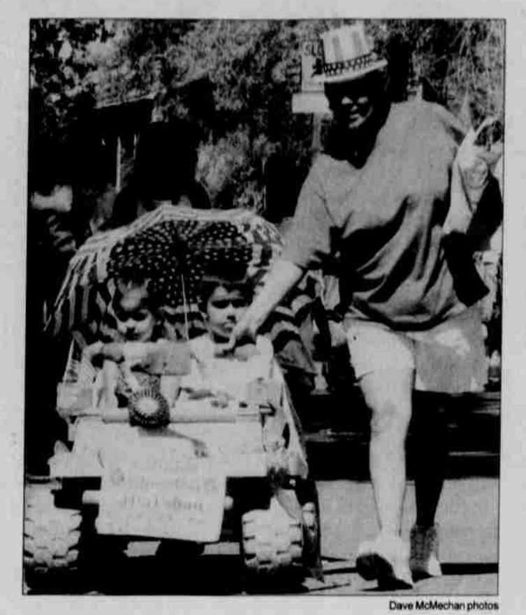
A sunny Fourth of July