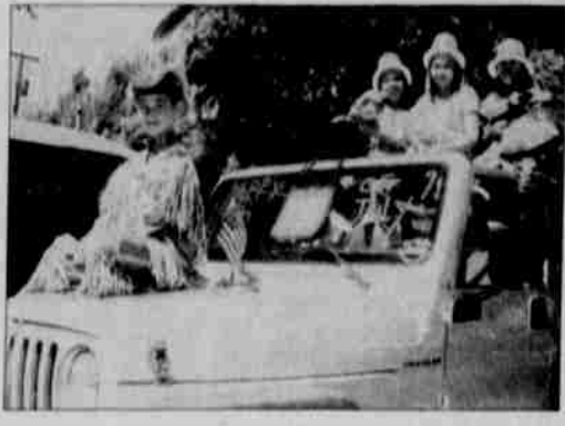
Warm and sunny weather greeted the annual Warm Springs Fourth of July Parade Monday. The parade was followed by a community picnic at the Community Center and fireworks after the sun went