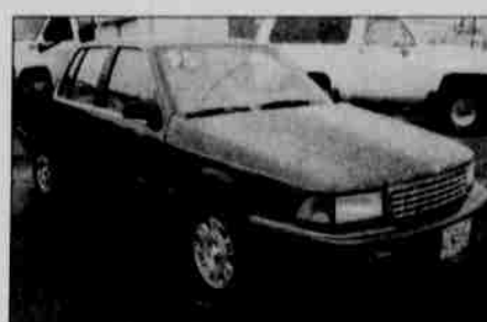
95 Plymouth Acclaim

Complete Exhaust shop, Tire Sales, & Service