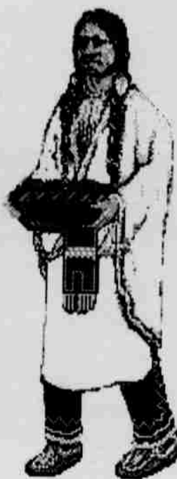
Visit your elders.

Language Elders Creator Learn You will pray Always