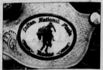
Detail from the All Around World Champion saddle.