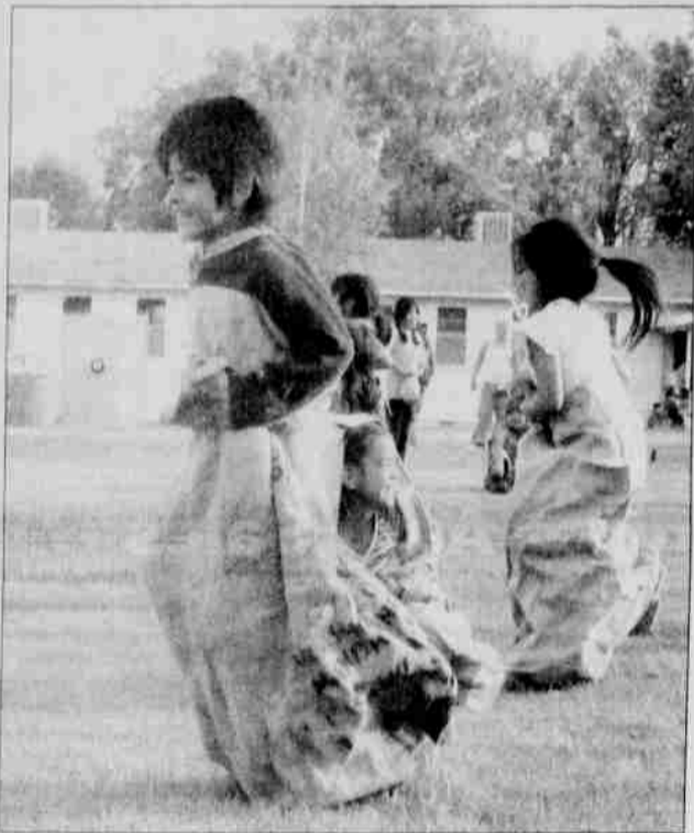
Students run in the sack-race contest during the recent back-to-school barbecue and school supplies distribution event.

Open 7 a.m. til midnight, Mon-Thurs. Weekends 7 a.m. til 2 a.m.