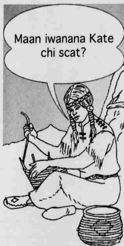
Where did Kate go tonight?