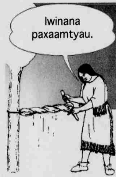
She went to the war dancing.

Mishnam nuwik'a ashukasha mna mash wa miyanash chikuuk? Do you honestly know where your child is at this time?