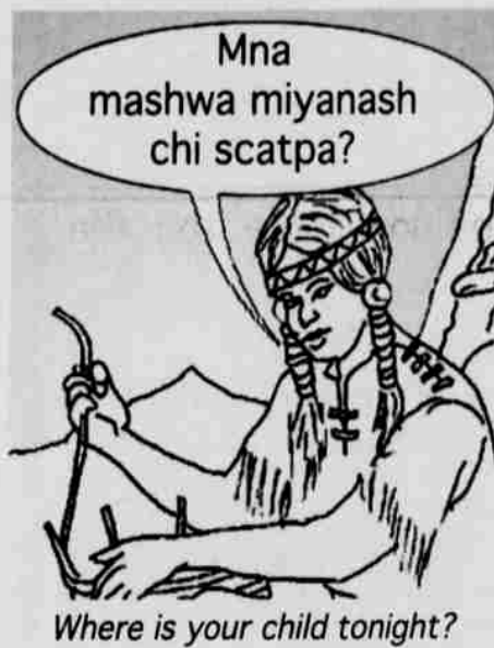
Where is your child tonight?

Iwata miyanash payu wapshwiki ana ku iwapchaiwita. A child is taught a lesson when he/she has misbehaved.