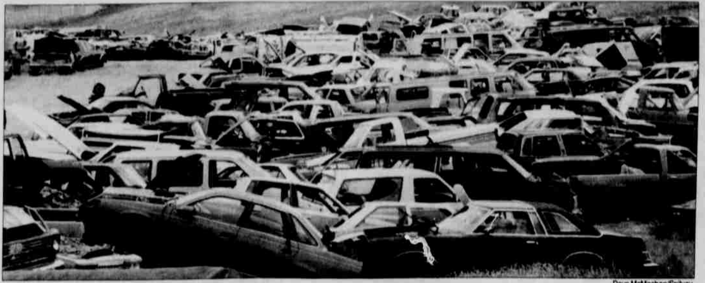
The area beside the landfill has been filled with hundreds of abandoned vehicles towed in from around the reservation.

Housing and Fire and Safety contracted with a private company to do the towing and the crushing. Some of the cars were stripped for parts that were deemed of some value.