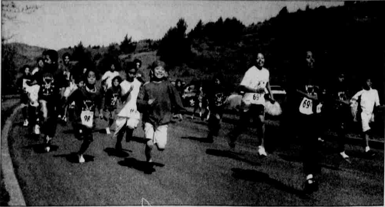
The take-off was full of energetic youth as they compete in either the one-mile, three-mile, or 10K, during the annual mini-marathon held at Kah-Nee-Ta High Desert Resort and Casino. See results in the next issue of Spilyay Tymoo.