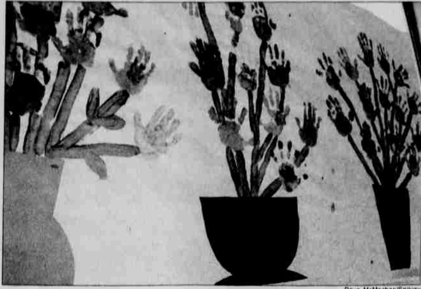
Warm Springs Elementary School students made artwork for the 21 st Century Teens' presentation.