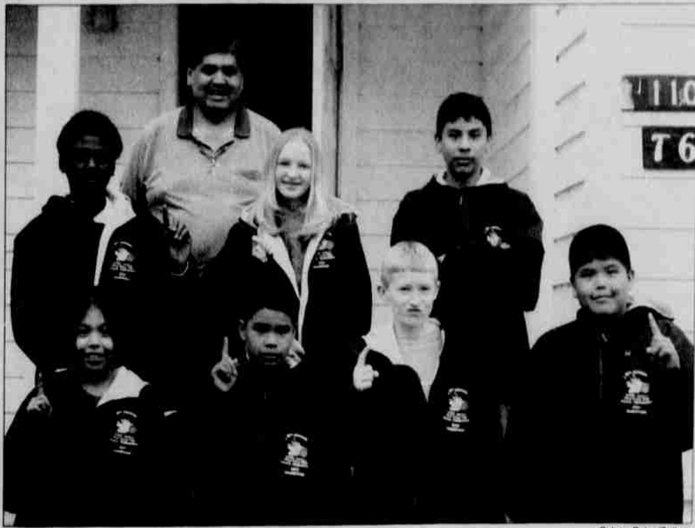
The Simnasho Red Devils, champions of the BAAD tourney.