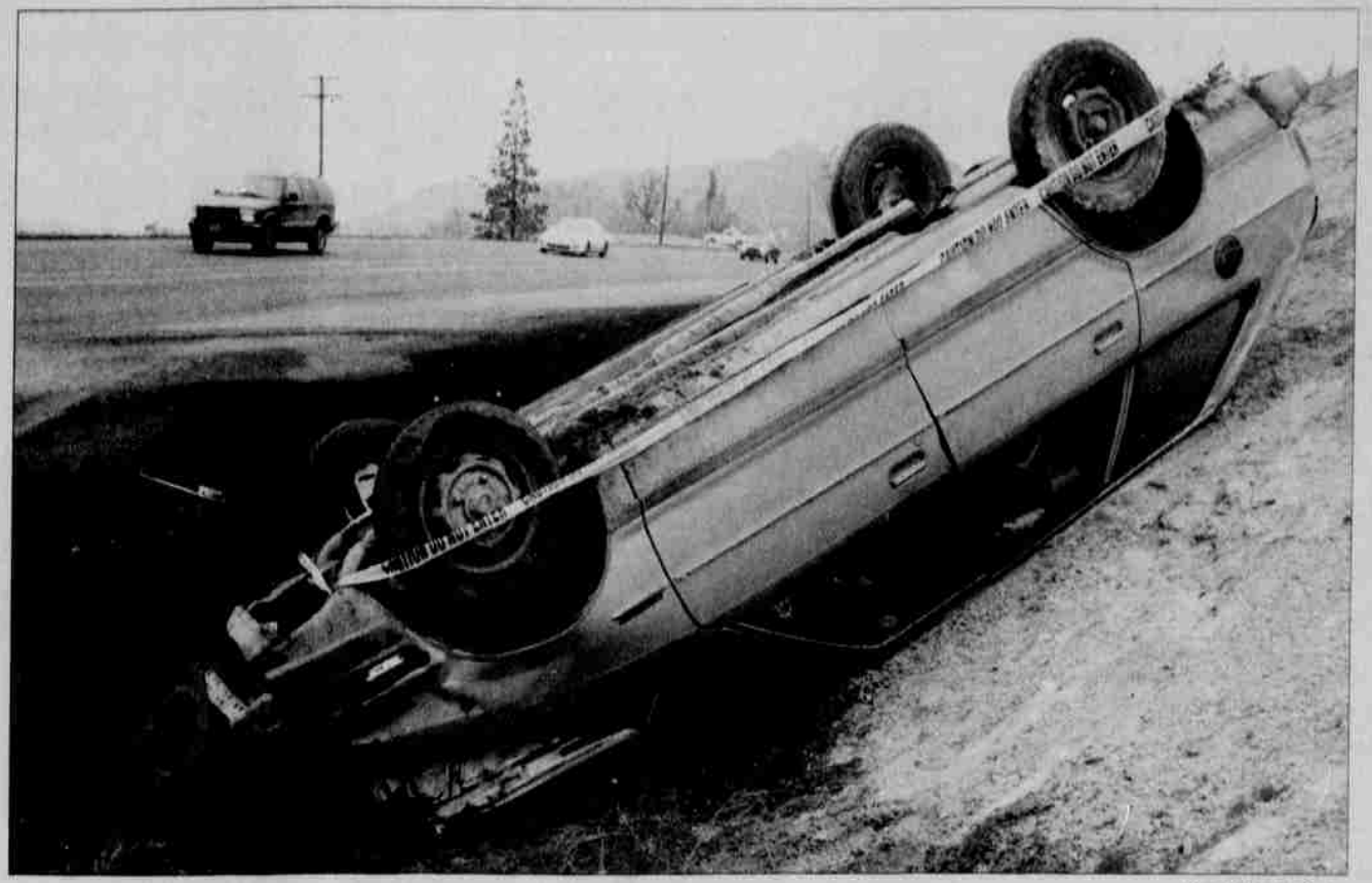
This vehicle overturned along Highway 26 near the Warm Springs Texaco Station. Fortunately, no one was injured.

The next deadline to submit letters, notices, birthday wishes, etc., to the Spilyay Tymoo is Friday, February 27.