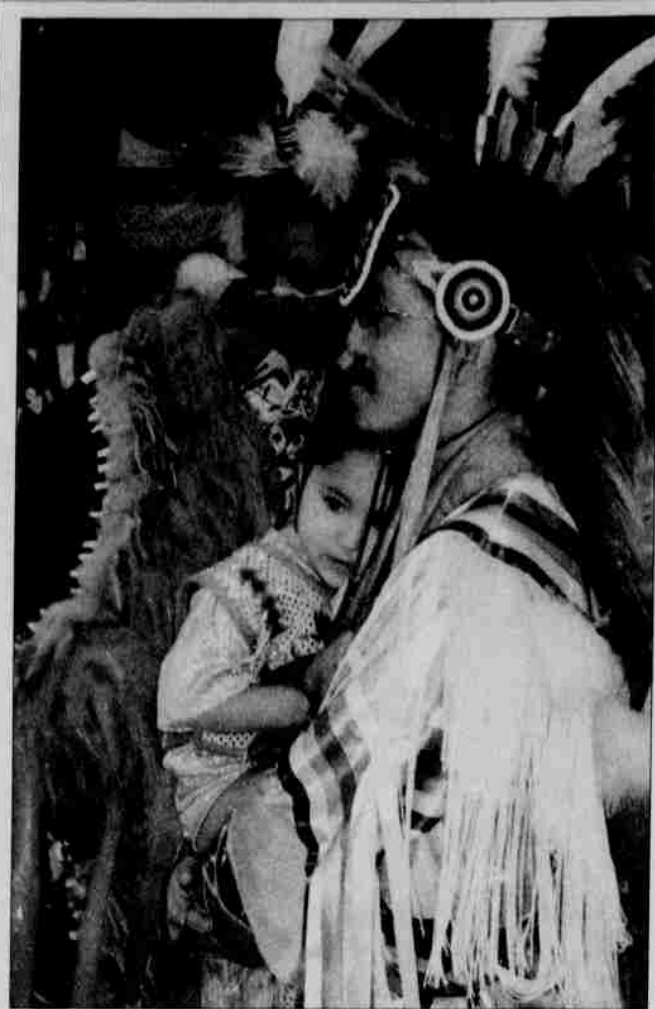
Photo taken during an inter-tribal dance at the Lincoln's Birthday Powwow.