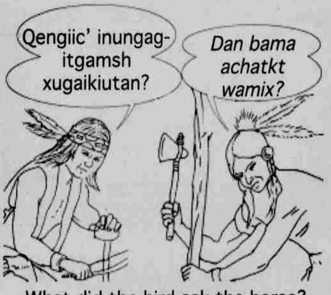
What did the bird ask the horse? Why the long face?