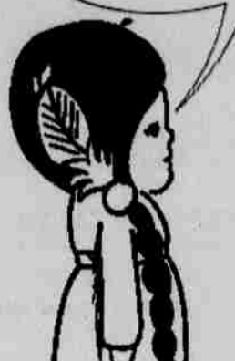
Did you folks hear about the man who No we don't know why he had b.o. on had b.o. on one side only?

Chauatash ashukasha mish auku ishatsim waxalam awacha tiwanii.