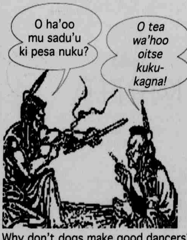
Why don't dogs make good dancers? Because they have two left feet!