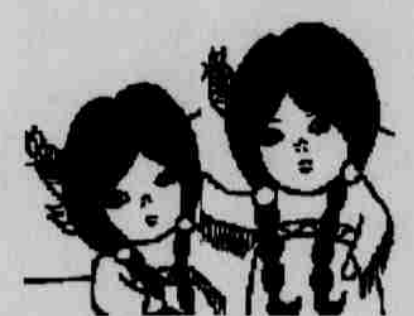
one side only

Chauatash ashukasha mish auku ishatsim waxalam awacha tiwanii.