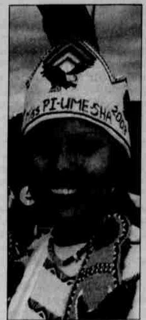
Indian Stick Games Start Friday; Stick Game Tournament Saturday.