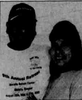
Reception from 7:30 p.m. to midnight at the Kah-Nee-Ta Lodge Wasco Paiute Room.