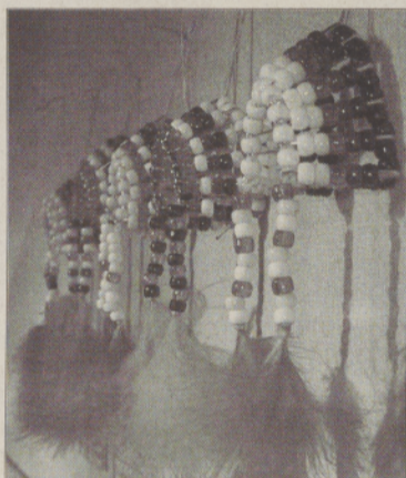
Selena T. Boise/Spilyay Tymoo

The youth are talented and you will see that when you see the display.