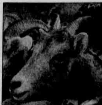
Above, bighorns arrive on the reservation. And below, bighorns are portrayed on a beaded bag made in the 1930s.

The name Mutton Mountains may be a reference to the bighorns, which once were plentiful in the rugged terrain.