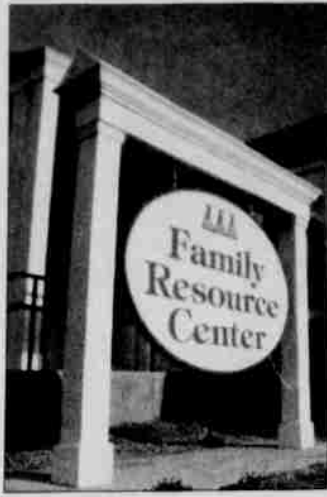
The center is for grand opening on Aug. 21

The Community Health Education Team (CHET), Adult and Family Services