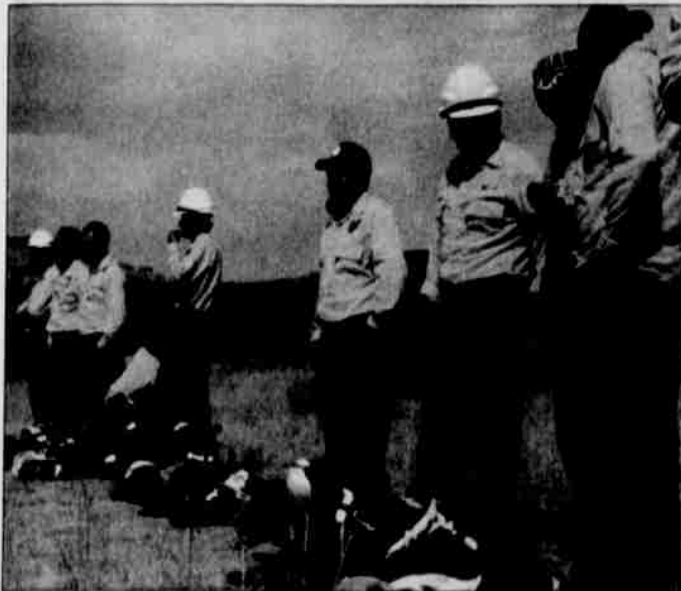
These firefighters assembled in Warm Springs as part of the Eyerly Fire response team.

consider replacing it with a more fire-resistant material.