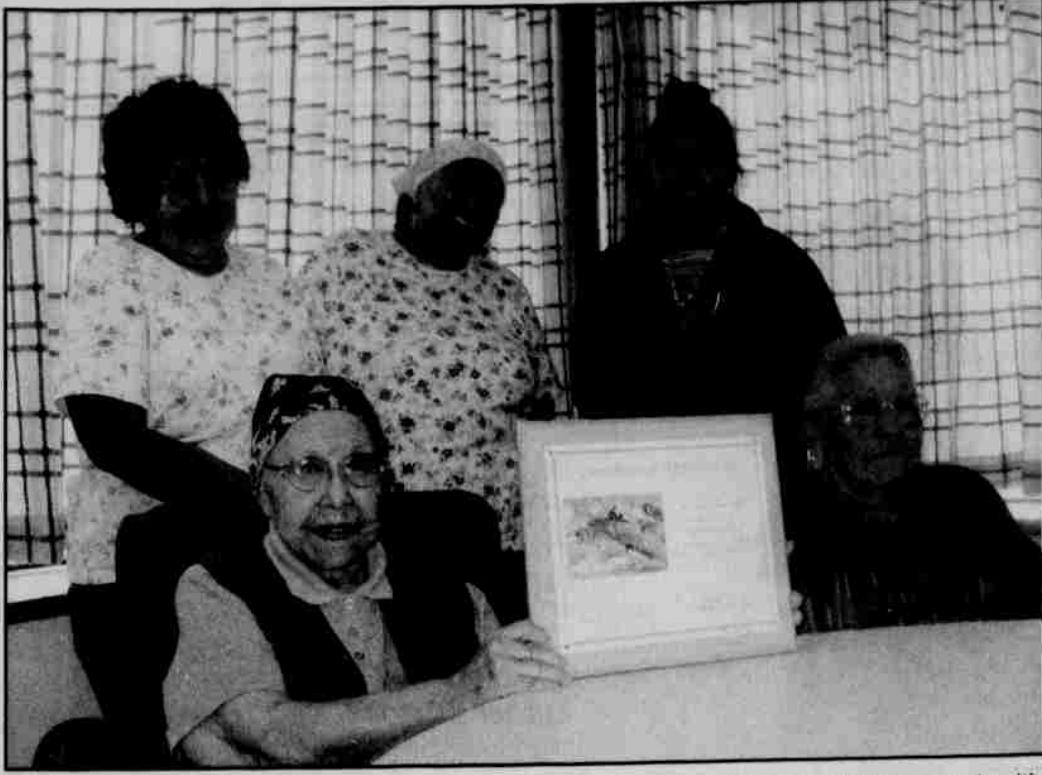
The Culture and Heritage Committee recently received a plaque in appreciation of work with the town of Mosier, which recently completed a fish restoration project.