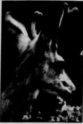
Concern for deer and other wildlife is why the tribes have appealed the county proposal.

Under the new ordinances landowners would be allowed to build houses on 15,000 square feet of A1 land zoned for exclusive farm use or 20 acres of rangeland that has been in the family since 1985.