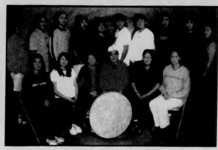
The Blacklodge Singers

Blacklodge took home three trophy's for hand drum north-