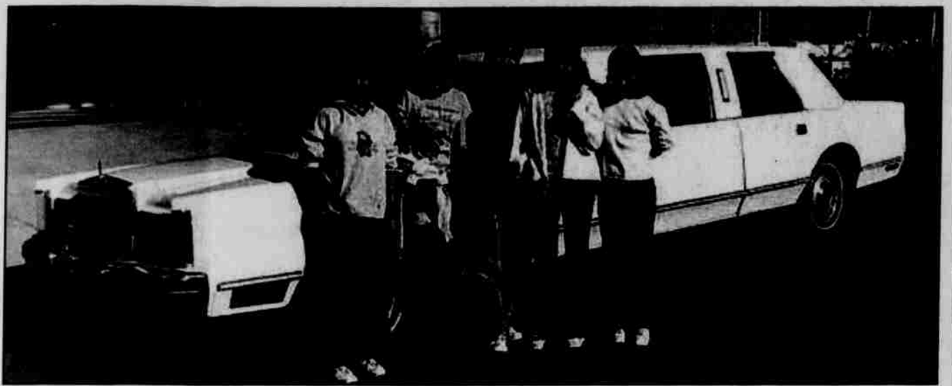
Tina Aguilar/The Spilyay