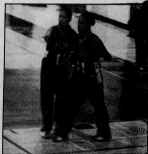
"Main Sisters" in warm-ups prior to the contest against Mt. View