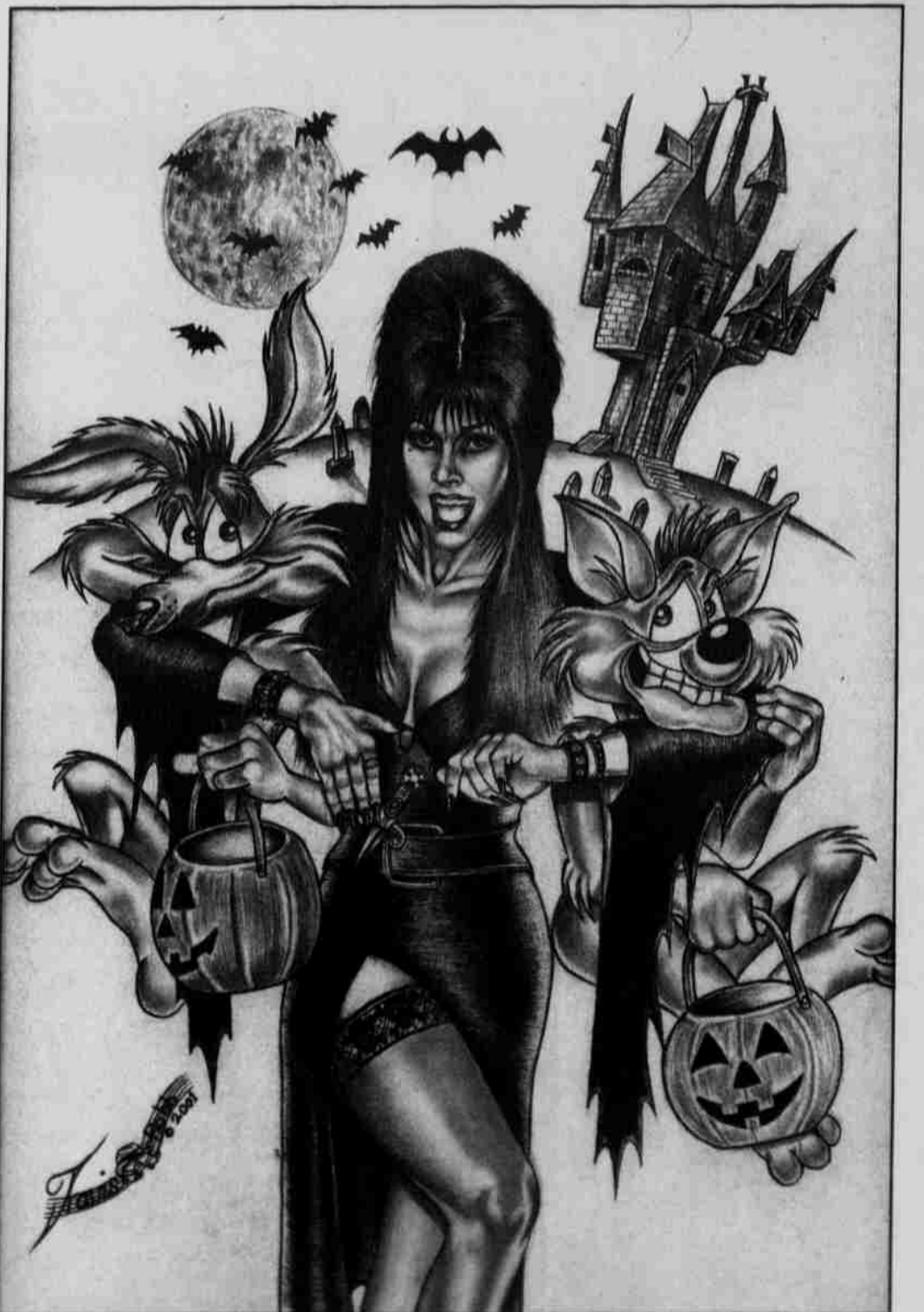
Illustration by Travis Bobb

Don't burn on dry windy days. Never leave the fire unattended, always have an adult present till the fire is completely out.