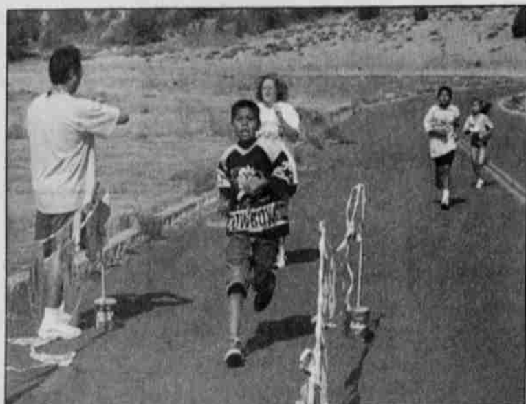
5K runners race to the finish at the Road Warriors Annual Pi-Ume-Sha Fun Run/Walk.

REMINDER Recreational Invitational Youth Track Meet July 24, 2001 At Madras High School Boys and Girls age 2-5 years, 6-13 years T-shirts and Ribbons to all participants