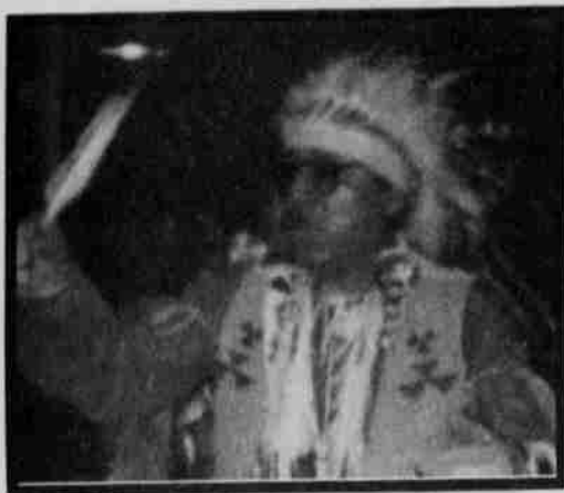
Niixna inaknúwixa pshtnm. He takes good care of us.

Inaknp'íwixatash awala inakwac'ílaknxa, kushxitash Inaktkwainpinxa. He takes us scaffold or pole fishing and hunting.