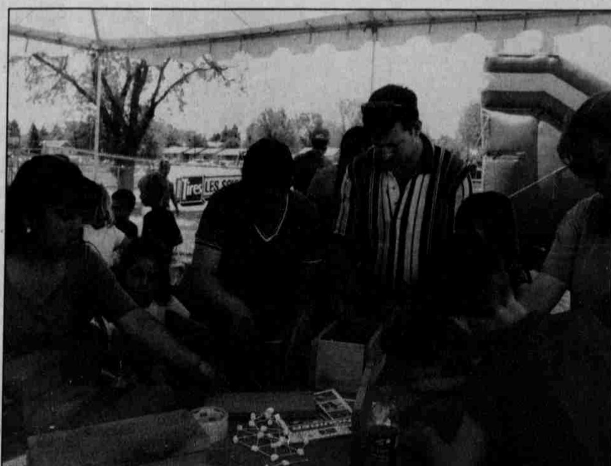
Families gathered together for craftmaking. These are wooden flower boxes that were filled with soil and flowers.