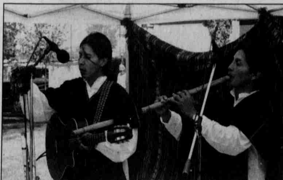
Flutist, guitarist performed all day.