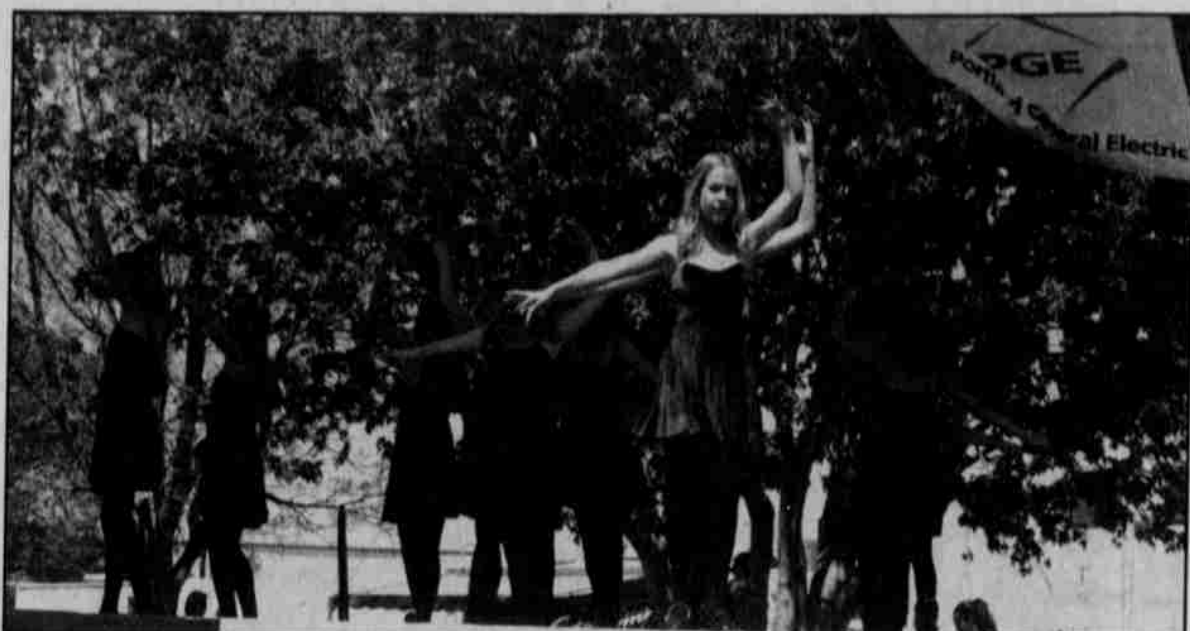
High Desert Dance Arts performed ballet, tap, jazz, and breakdancing.