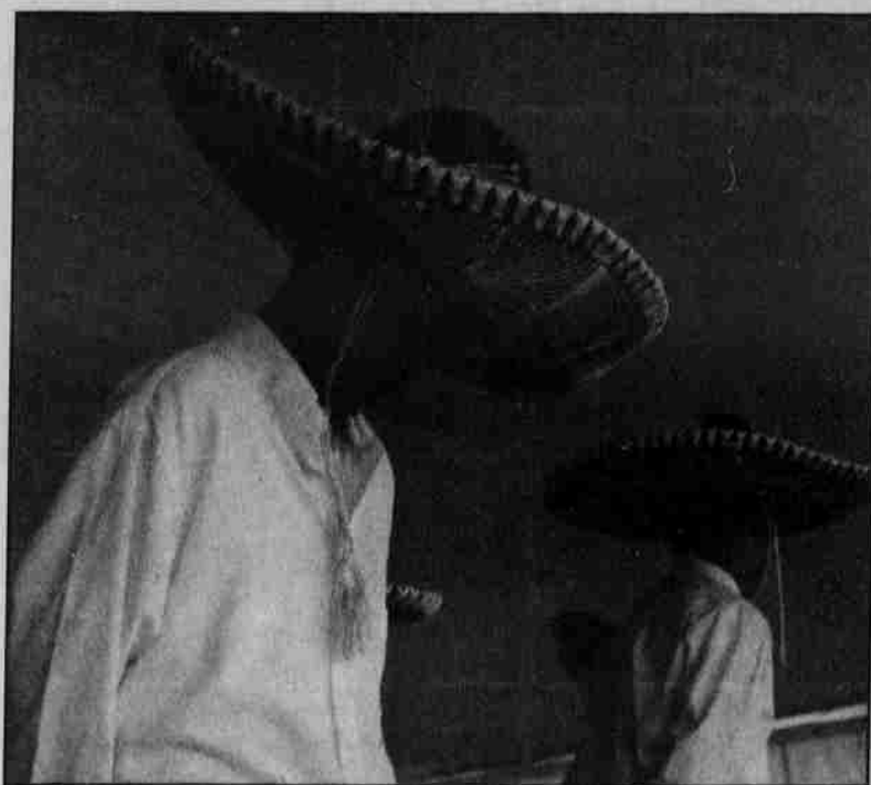
Hispanic dancers from Jefferson County Middle School dance group.