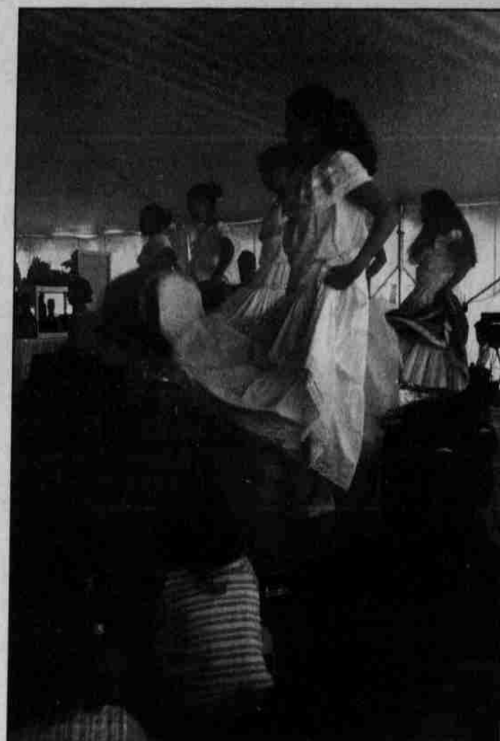
Hispanic Dancers performed traditional dances.

The Annual Collage of Culture was held Saturday, May 19, 2001.