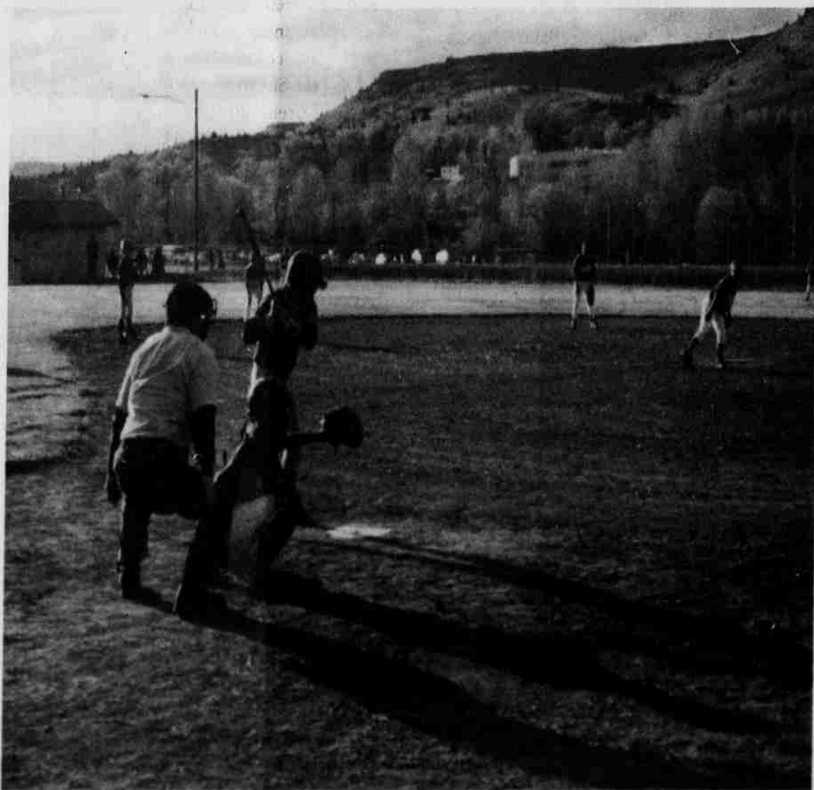
Action during Papooses vs Christian Church, played May 2, at the Papoose field.

May 7 JC @ Warm Springs May 21 Warm Springs @ JC June 4 Warm Springs @ JC