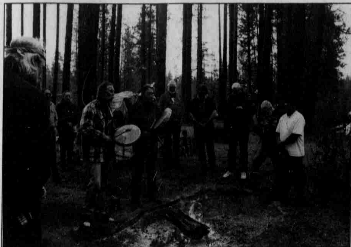
Veterans gathered in a Healing Circle held last month at the He-He Longhouse.