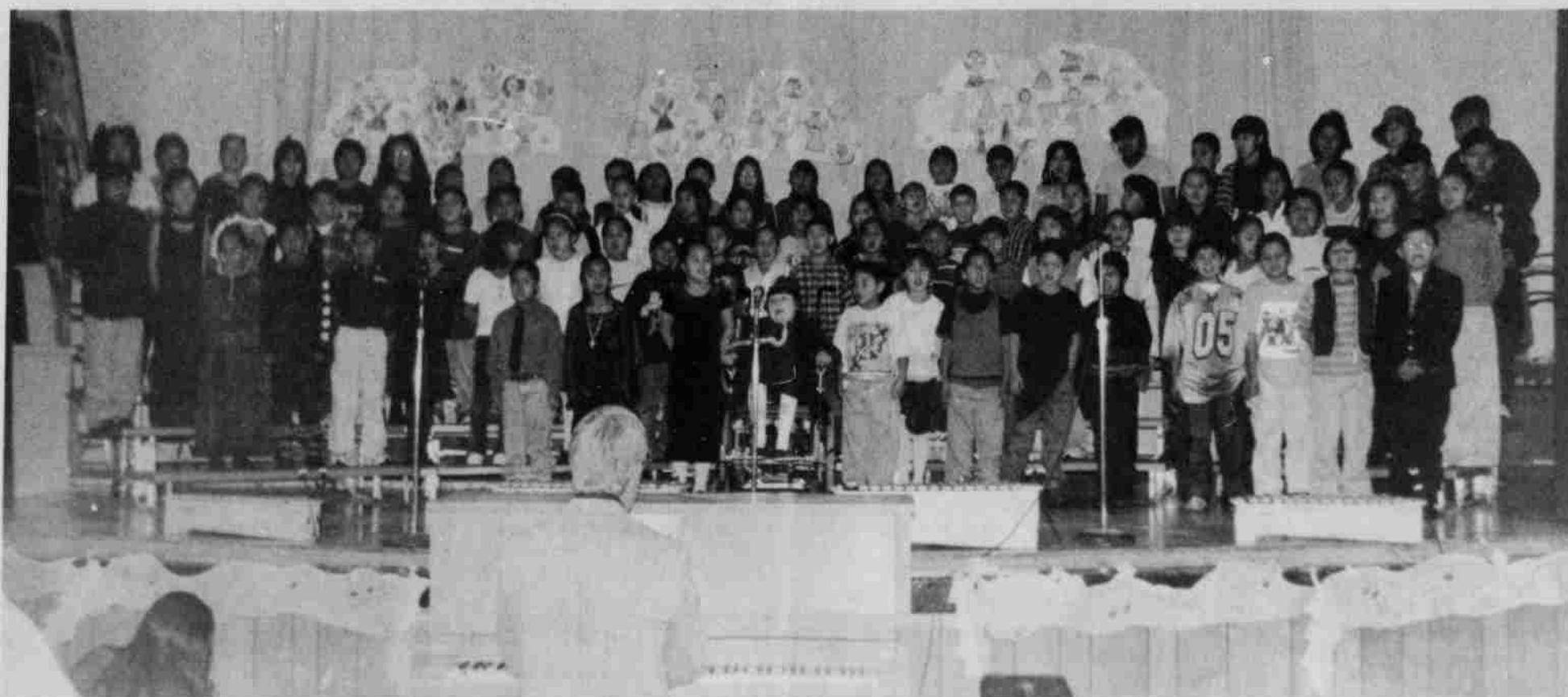
The third grade class makes a "joyful" noise for the parents at the Christmas concert.