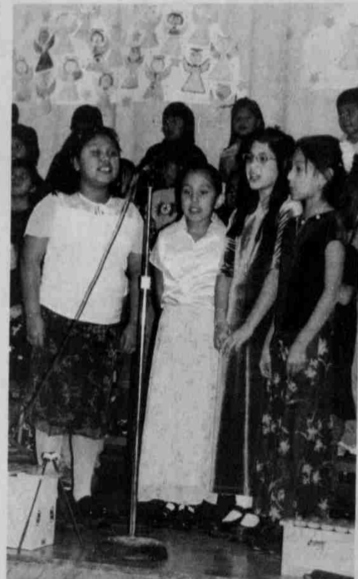
These third grade young ladies were all dressed up to sing a quartet at the program.