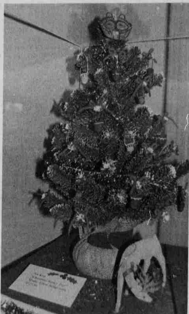
A Christmas tree decorated with tiny baskets for ornaments.