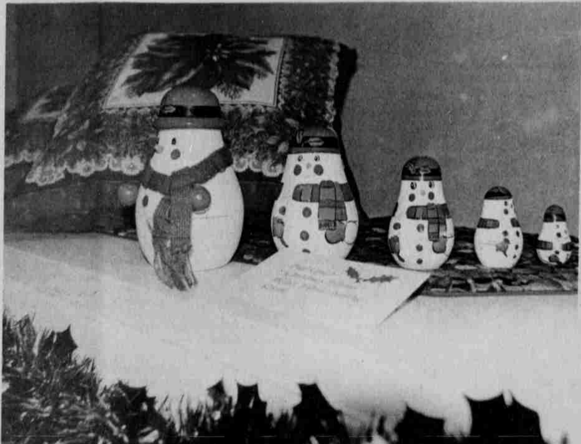
Handcrafted pillows and snowmen.