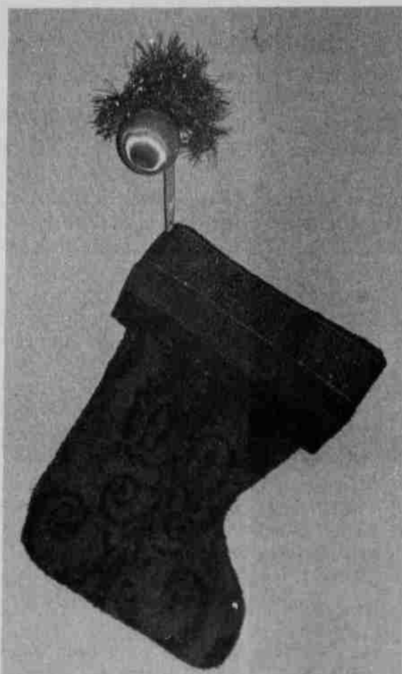
Wouldn't you like this stocking hanging from your chimney?