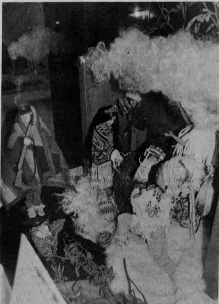
A beautiful display of Jesus and Mary in the Manger.