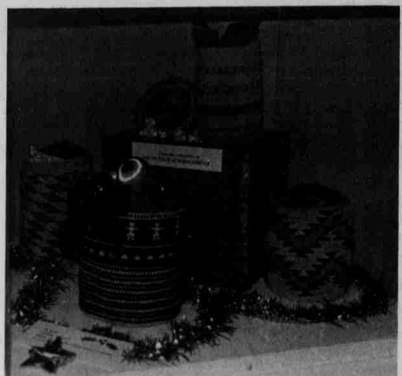
These baskets from the Museum's collection decorated nicely with ornaments.