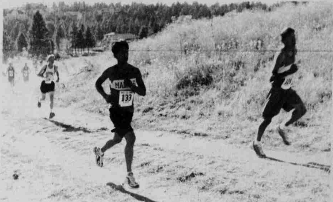
Running is a popular exercise for the fitness challenge. These high school students make it look fun.