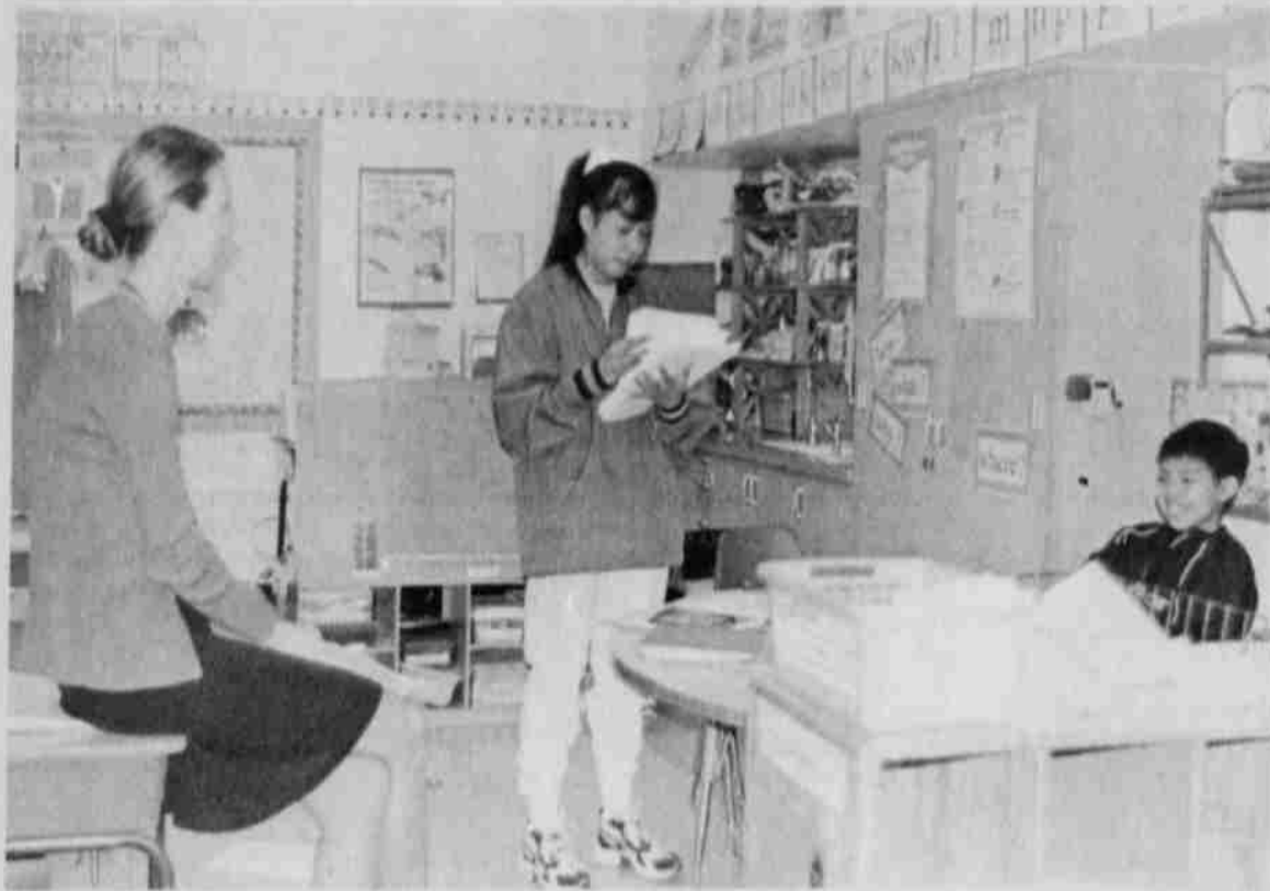
Warm Springs Elementary School held their open house October 5. Parents met their students teachers and were seeing all the work their students have done so far. It was a fun gathering for all.