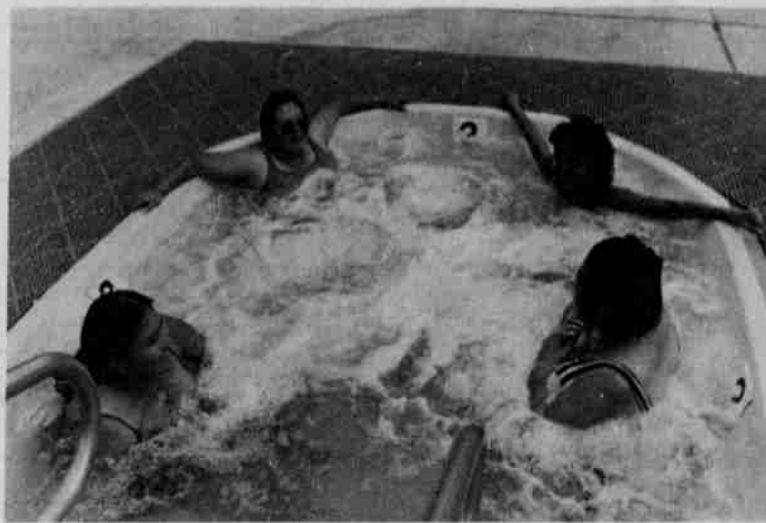
Jacuzzi anyone? These ladies are relaxing to the max.