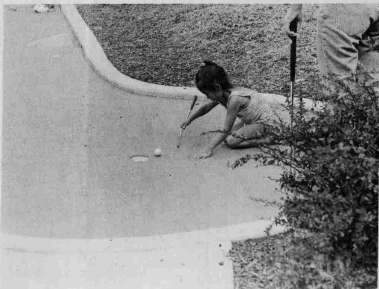
Miniature golf played in many ways.

The 2000 employee appreciation picnic was held on Friday, September 15, 2000. The picnic was filled with all sorts of activities to do such as: Golf, 3-on-3 basketball, slot tournaments, putting tournament, free swimming, lunch and dinner for all employees. The appreciation day was put fourth by the Tribal Council, along with many other volunteers. It was a festivity to be enjoyed by everyone and tribal council hopes that everyone had a great time.