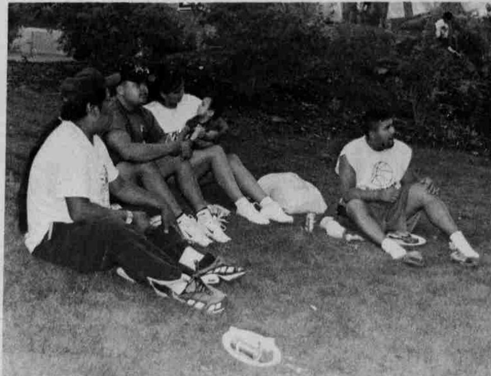
Evening dinner was good. These guys are eating it up.

The 2000 employee appreciation picnic was held on Friday, September 15, 2000. The picnic was filled with all sorts of activities to do such as: Golf, 3-on-3 basketball, slot tournaments, putting tournament, free swimming, lunch and dinner for all employees. The appreciation day was put fourth by the Tribal Council, along with many other volunteers. It was a festivity to be enjoyed by everyone and tribal council hopes that everyone had a great time.