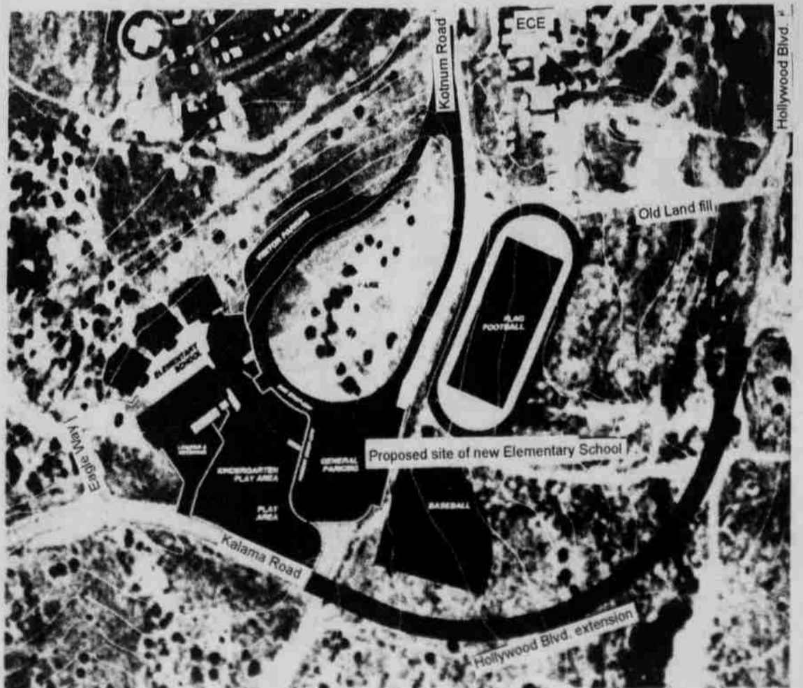
Architectural drawing shows site of proposed new elementary school. University of Oregon Library Received on: 09-13-00 Spilyay tymoo.

Tribal Council will hold another meeting and possibly set a date for a referendum for Tribal Members to vote.