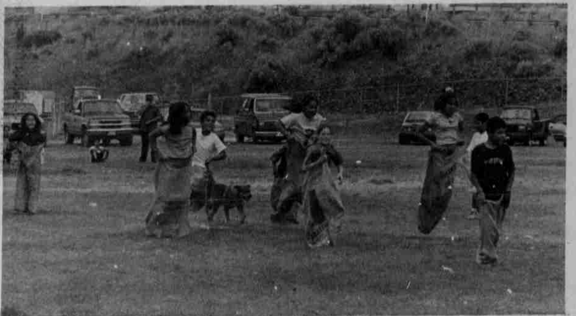
The sack race drew many entrants young and old who enjoyed the event.