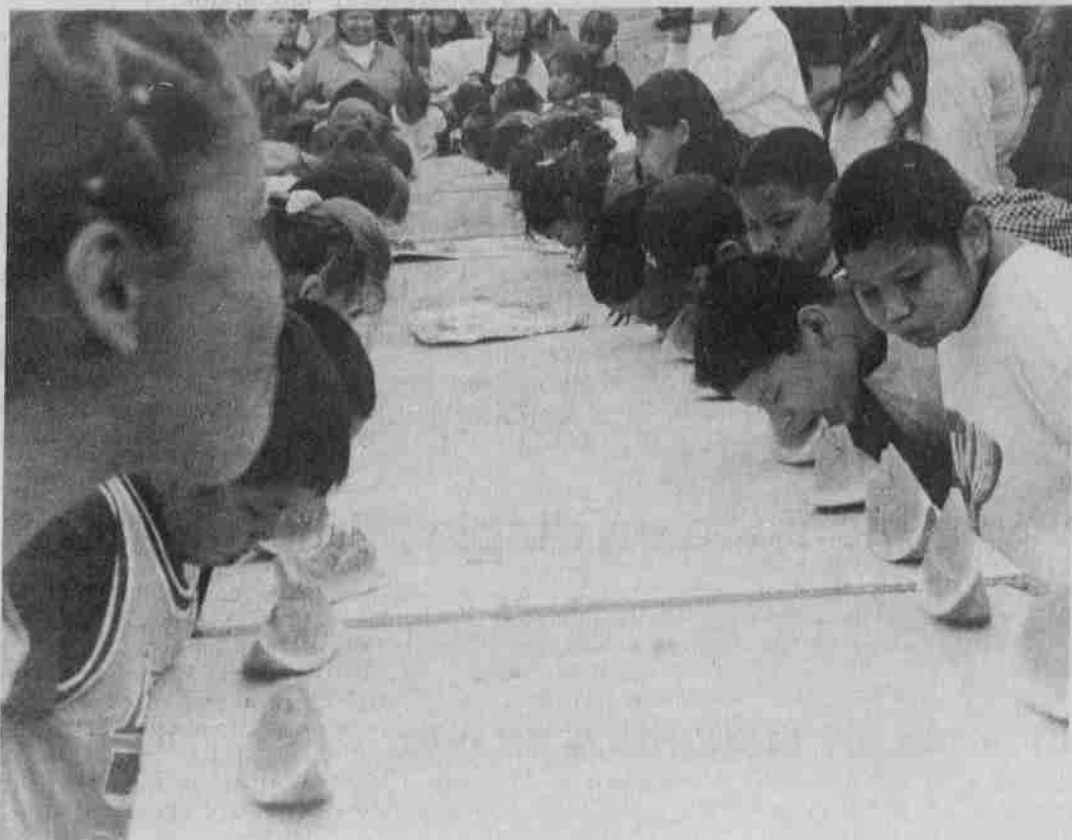
The Water Melon eating contest saw a lot of youngsters in the contest.