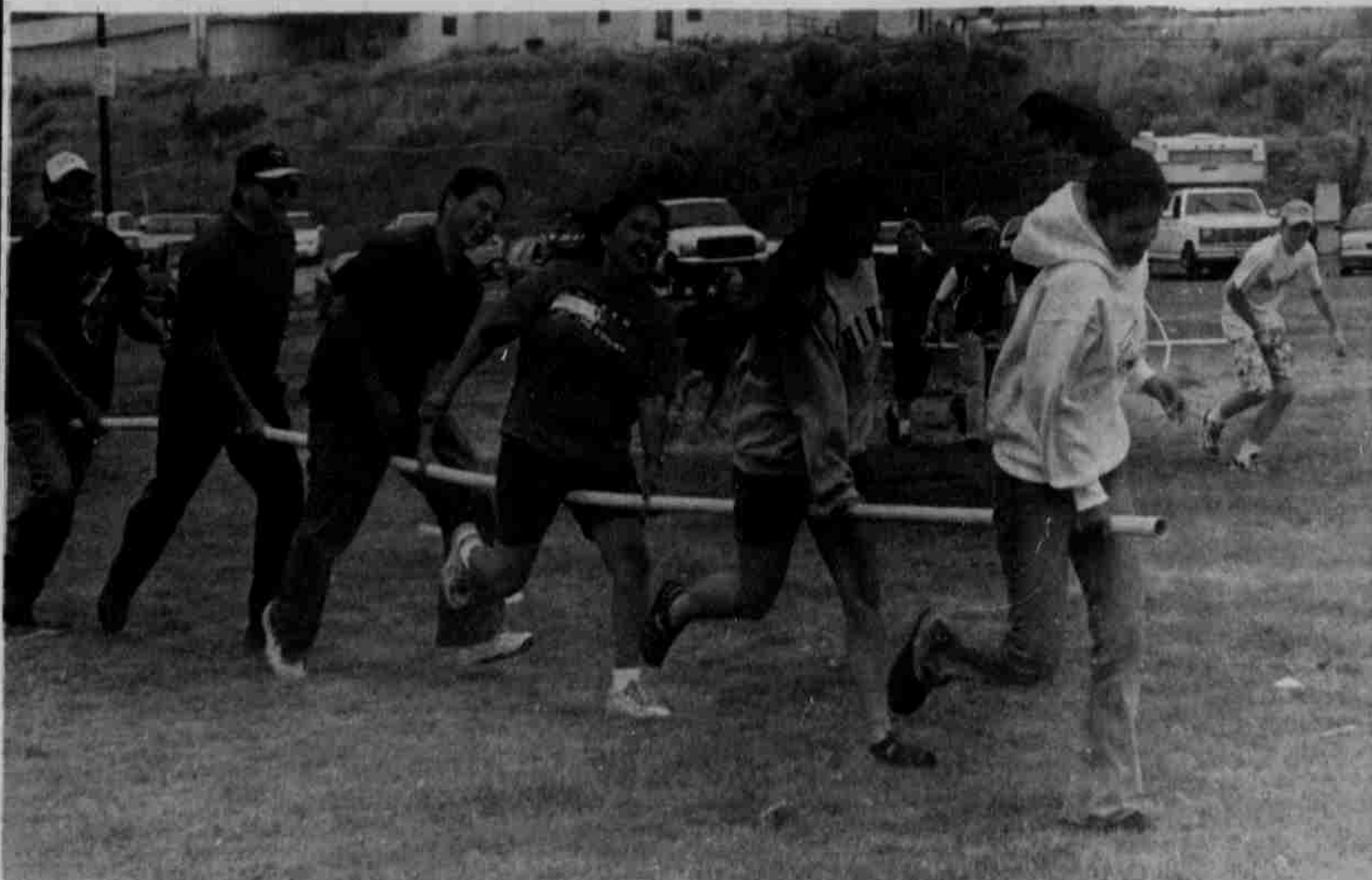
The winners of the Pole race during the Fourth of July, fun day games behind the Community Center.