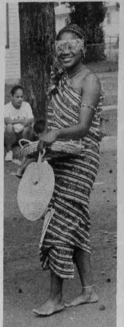
Another basket full of candy.