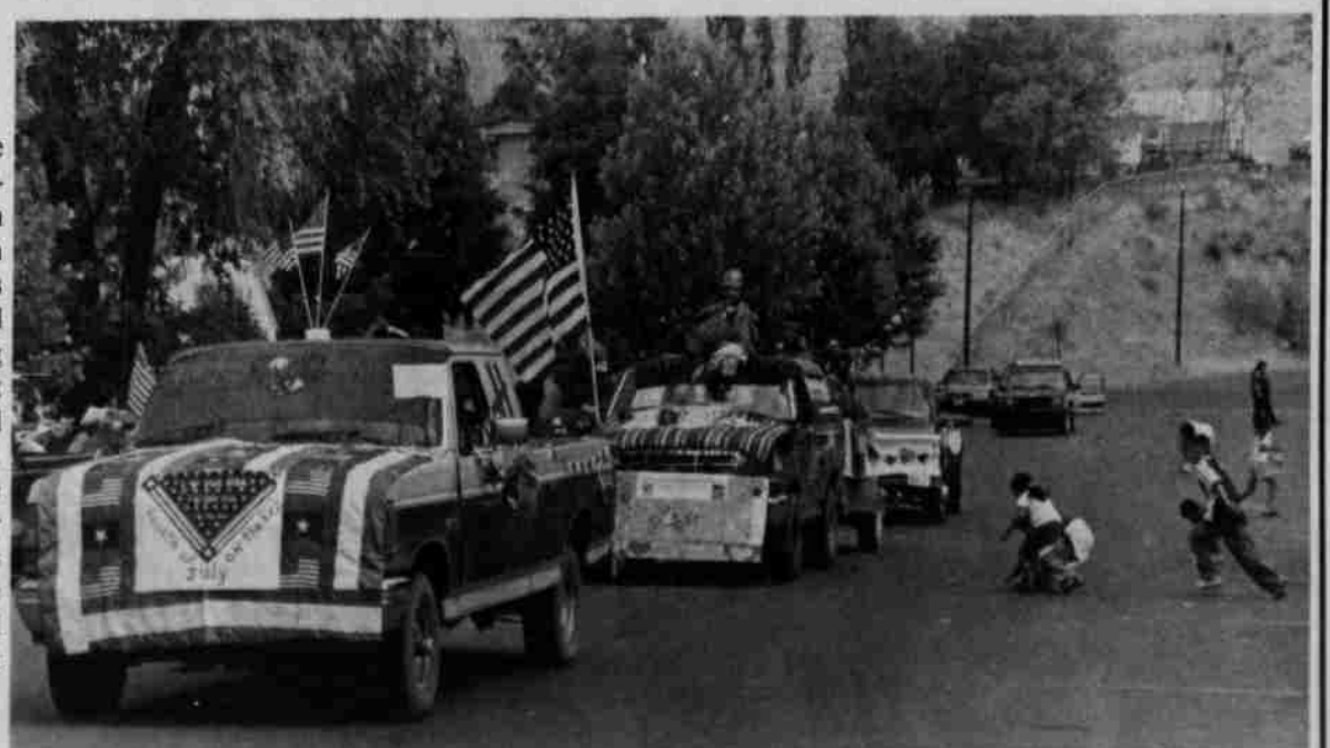
Parade floats threw candy out to children, as they raced for it.

pate against each other while on the other side the winners kept going until the final race.