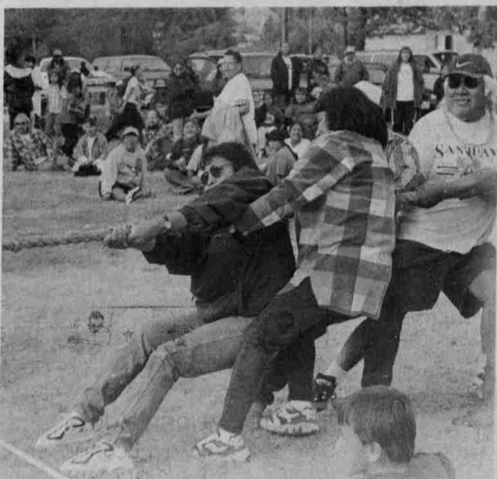
The Tug-O-War, the highlight of the day.