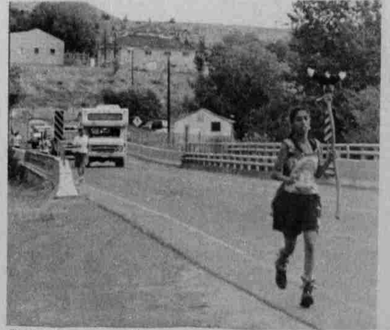
Each runner came at their own pace. This runner looked pretty worn out.