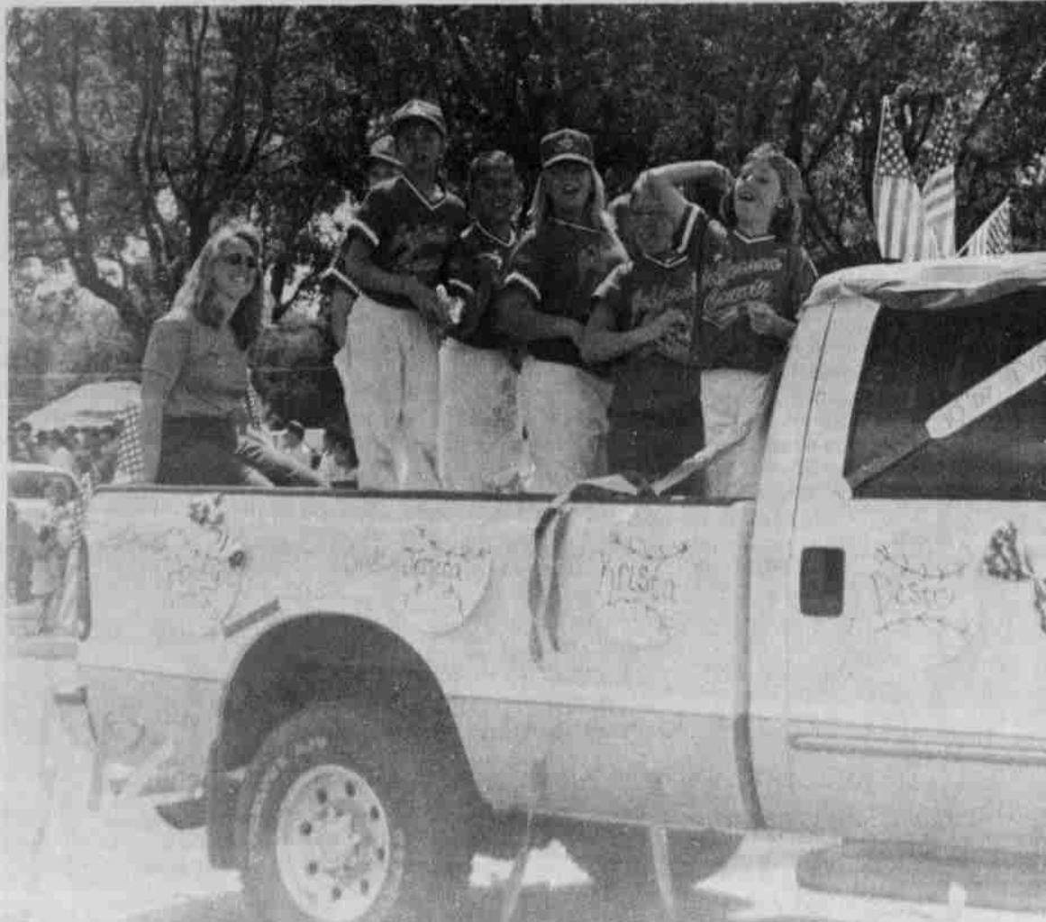
Jefferson County All-Stars in the Fourth of July, 2000, Street parade in downtown Madras, OR.

The March of Dimes is a non-profit organization whose mission is to improve the health of babies by preventing birth defects and infant mortality. Founded in 1938, the March of Dimes funds programs of research, education, community service and advocacy that save babies. Together, we save babies.