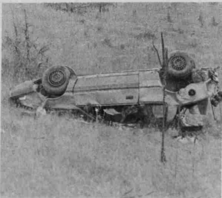
Accident vehicle, 1996 Pontiac Grand AM rests on it's top

Alcohol and excessive speed are contributing to the accident. The investigation is still ongoing.