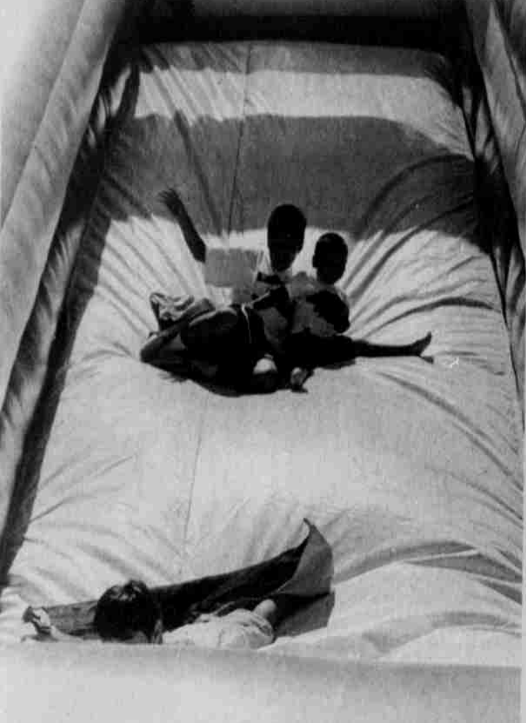
The slide was a popular attraction.

For further information call Gladys at (541) 475-3190.