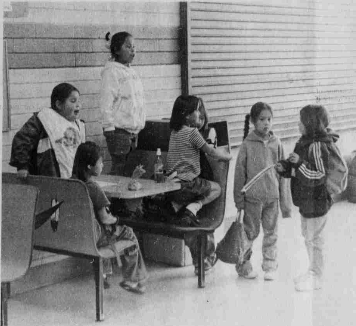
Here are some of the girls in the club just hanging out with each other