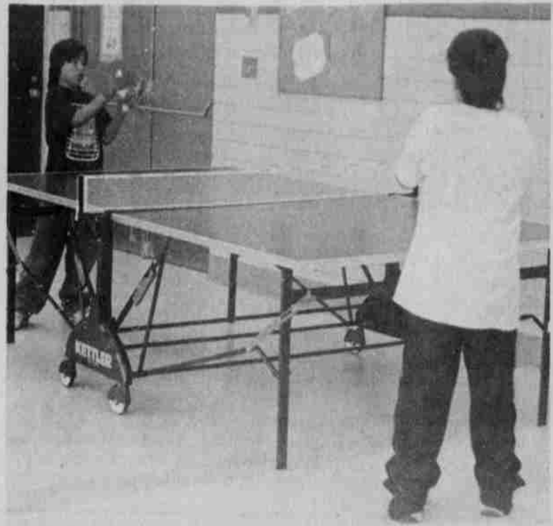
here are some kids playing ping pong

This is a good addition to our community and I encourage all parents to go down and sign your kids up. The club is always looking for more kids. This club will help kids realize their dreams and help them establish goals for themselves.