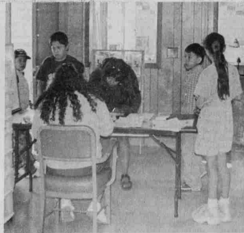
Lady shown above signing up her kid, while other kids wait in line to sign in