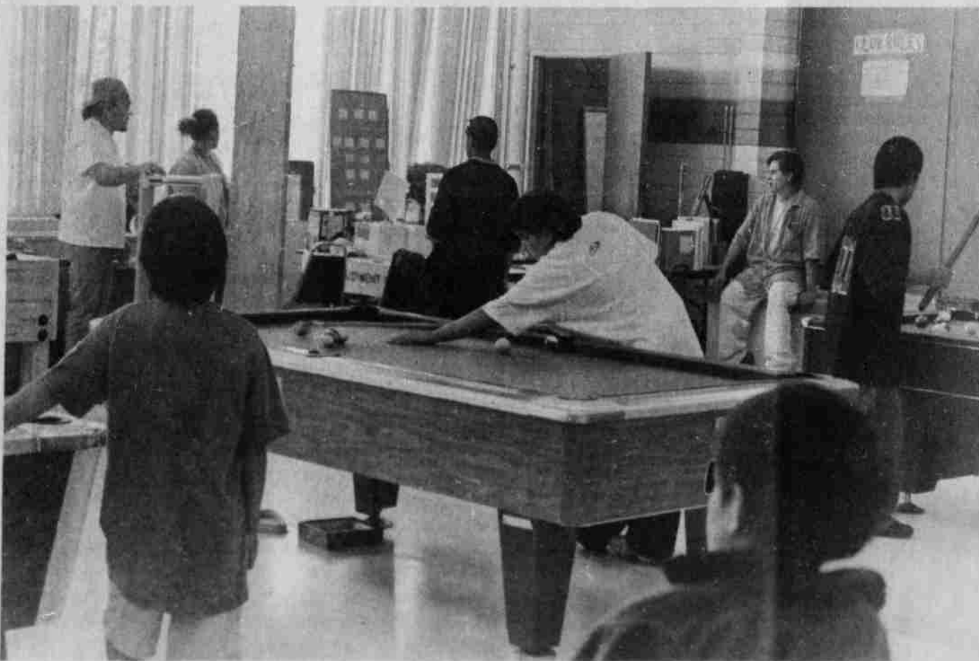
Here's what most of the kids do while at he boys and girls club, enjoy a good game of pool