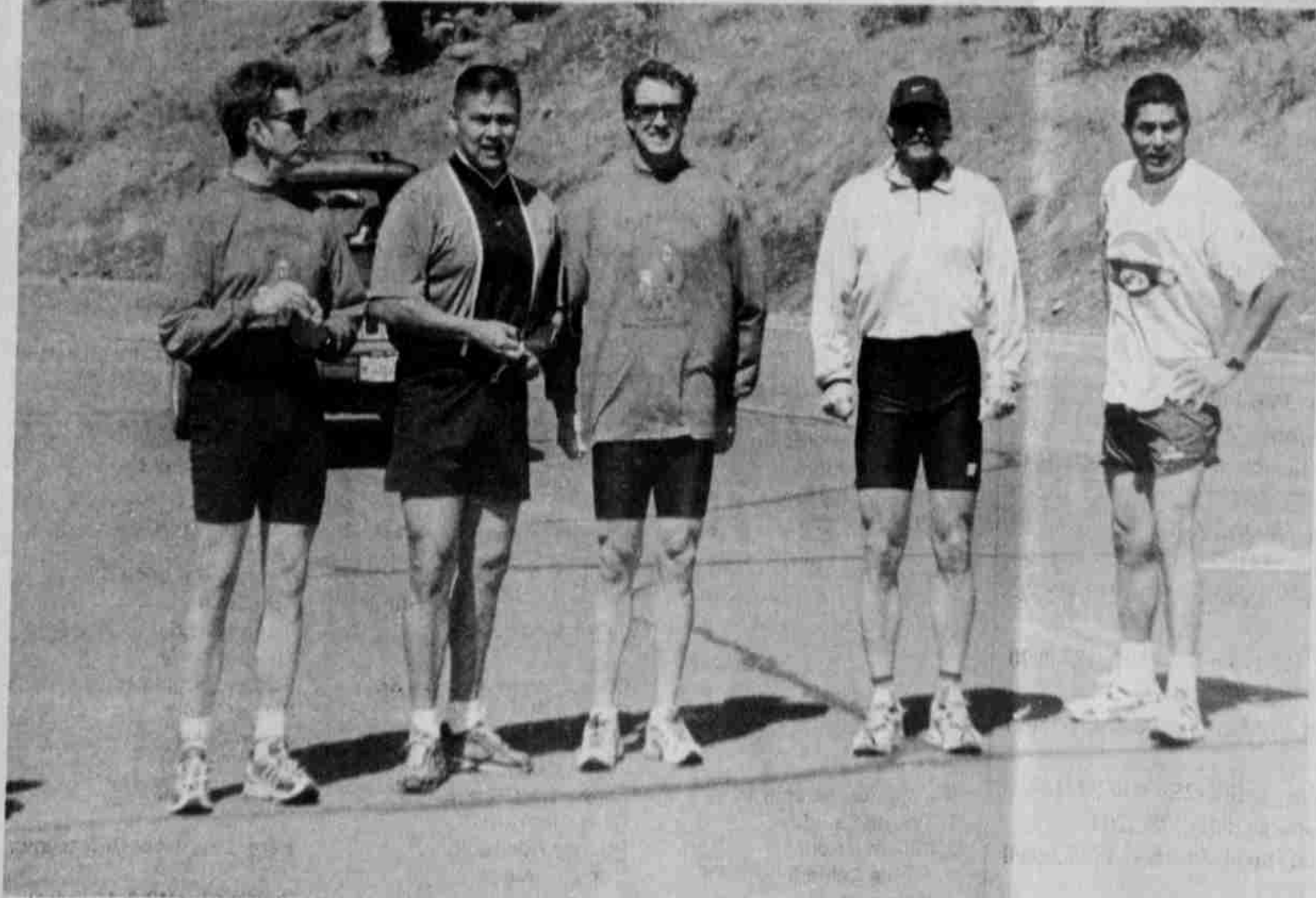
Here is all the participants that took part in this years Rez Biathlon. They all showed a lot of heart in doing this grueling race all by themselves.

The Rez Biathlon was held on April 22, 2000 at the Kah-Nee-Ta Village