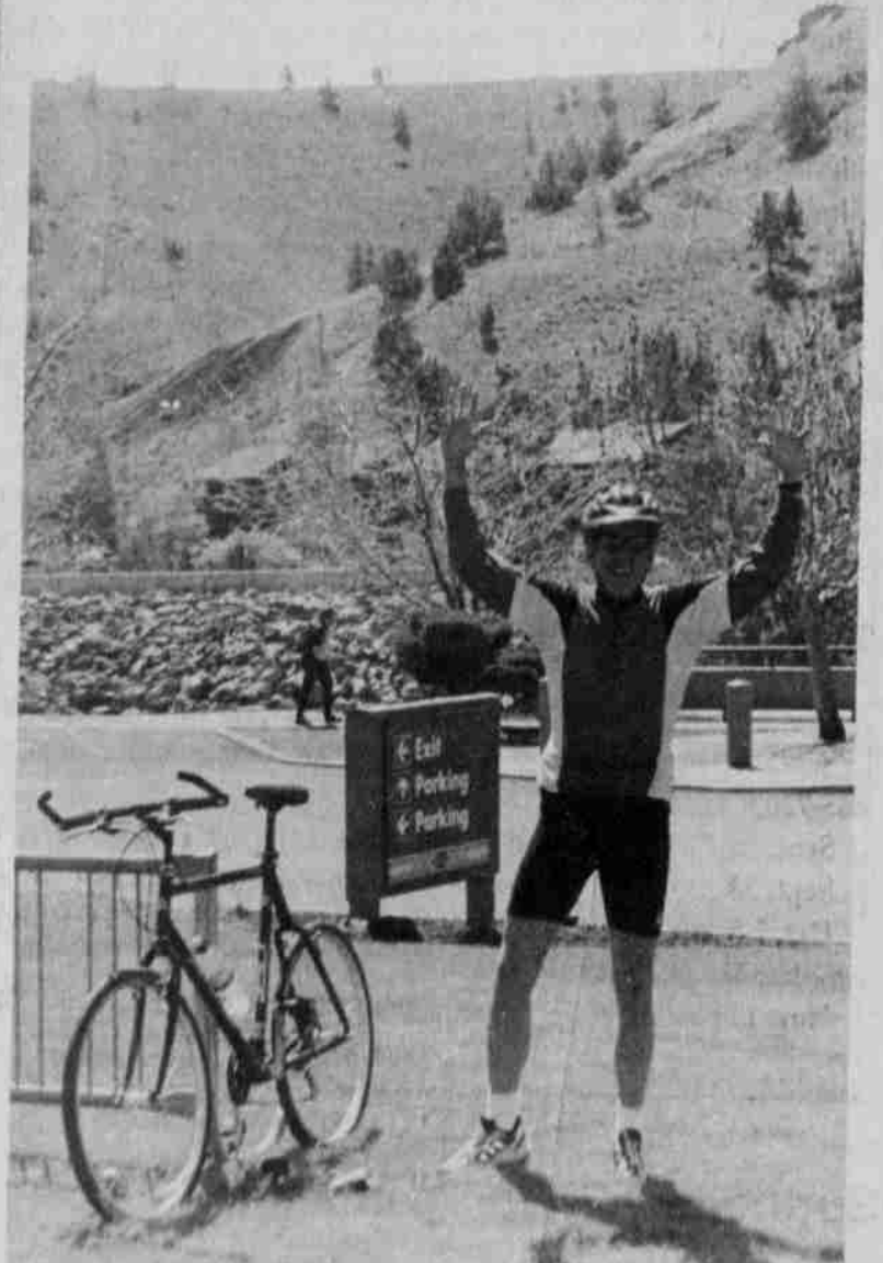
One participant that was really eager to go ahead with his bike ride