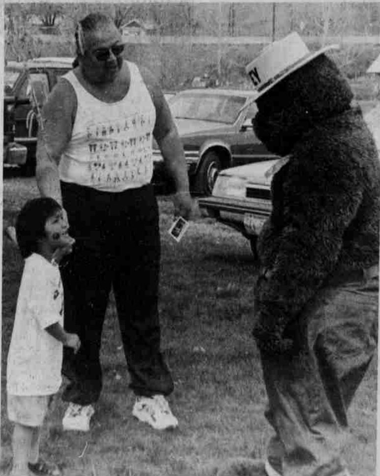
Smoky the Bear made his appearance visiting with all event participants during the day

Warm Springs Community members, look forward to the next chili cook off in the year 2001. CHET plans to have this continue as an annual event.