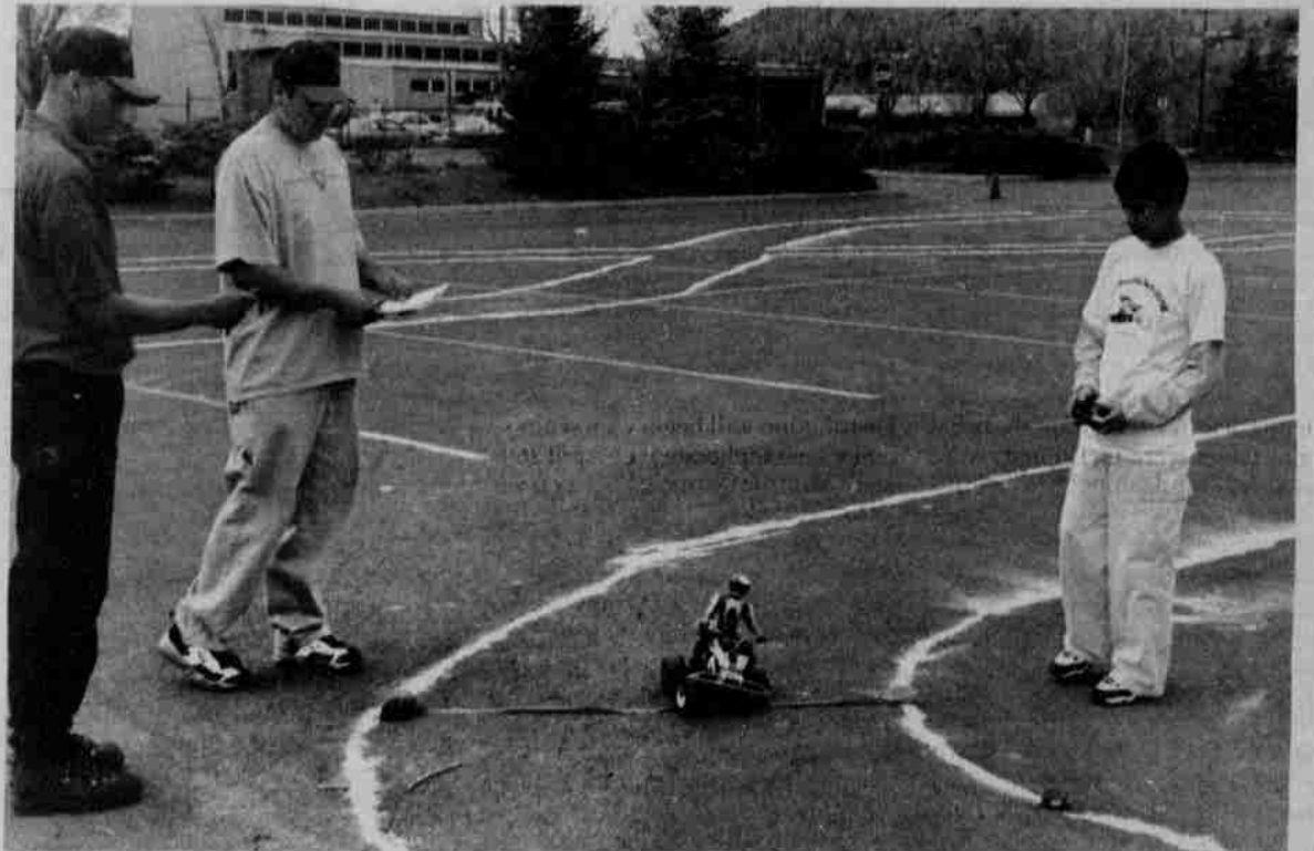
The Remote Control Car Race brought many participants with very nice and fancy remote control vehicles