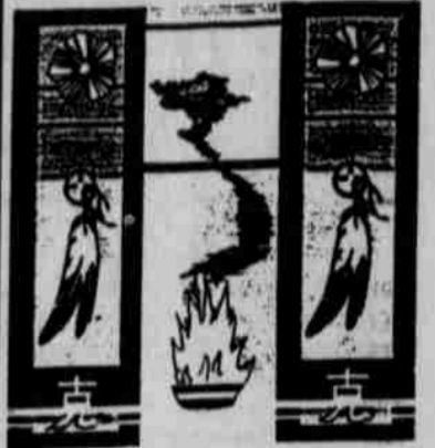
The design of this logo was created to represent the contributions of American Indian Veterans (the eagle feathers), American of Japanese Ancestry veterans (the Japanese character meaning "to overcome"), and Native Hawaiian veterans (the hibiscus flower). Their fire burning below a representation of the map of Vietnam reflects the trauma that many of these veterans experienced and the healing they seek.