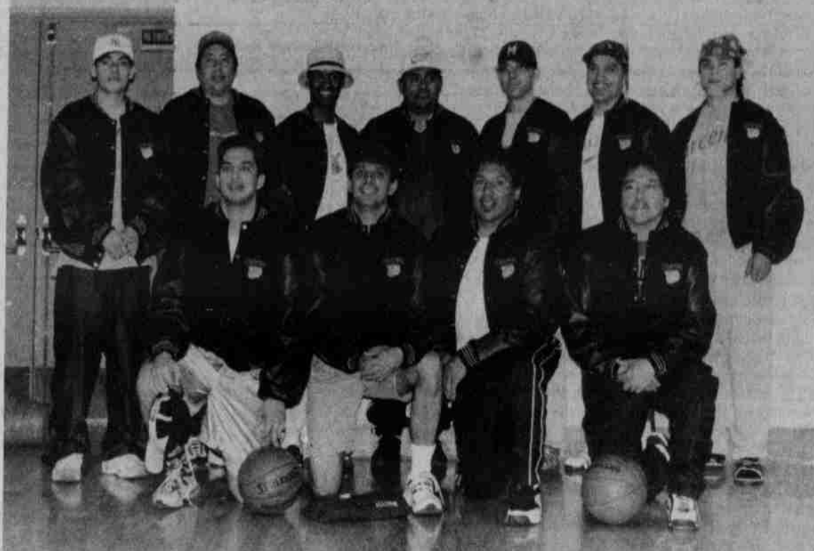
Warm Springs hosts the 6 foot and under Nationals. Champions were United Tribes.