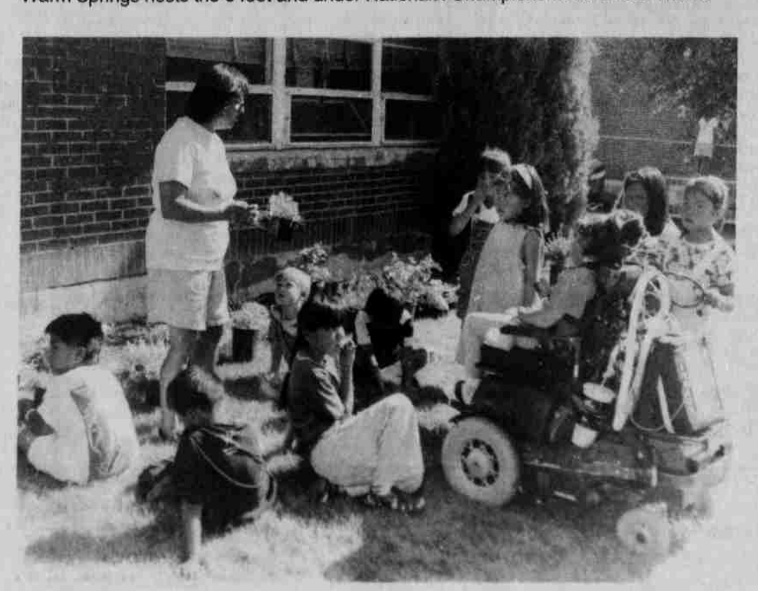
Warm Springs Elementary held their first "Summer Academy". Successful enough to look forward to next summer.

Hopefully the futrue is more bountiful in what ever activity we may become engaged with. Many ways to go for a brighter future.