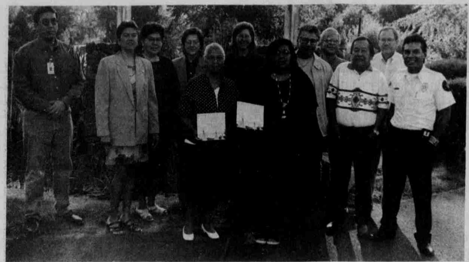
The Comprehensive Plan was completed and mailed out to each tribal member.