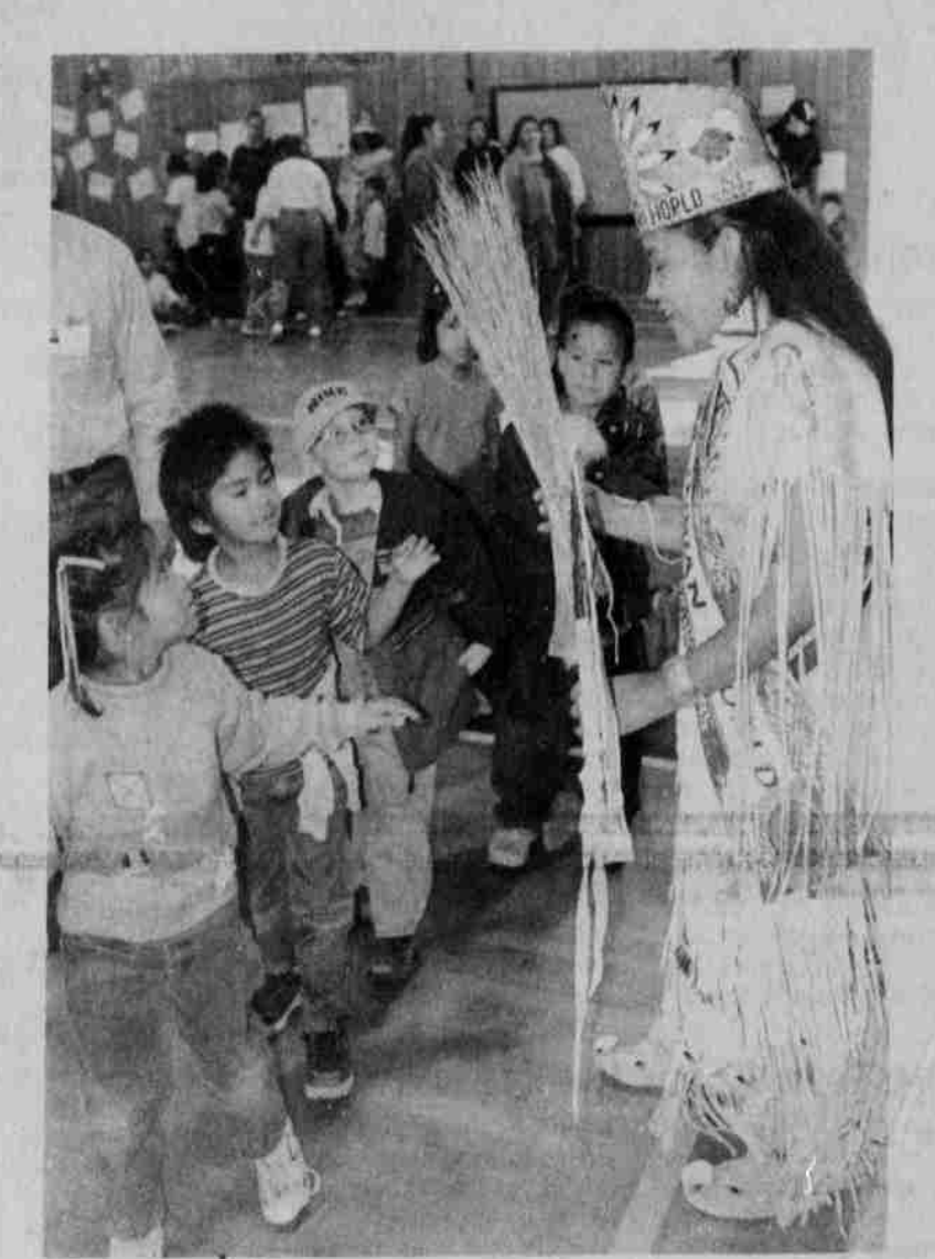
Miss Indian World visits Warm Springs.