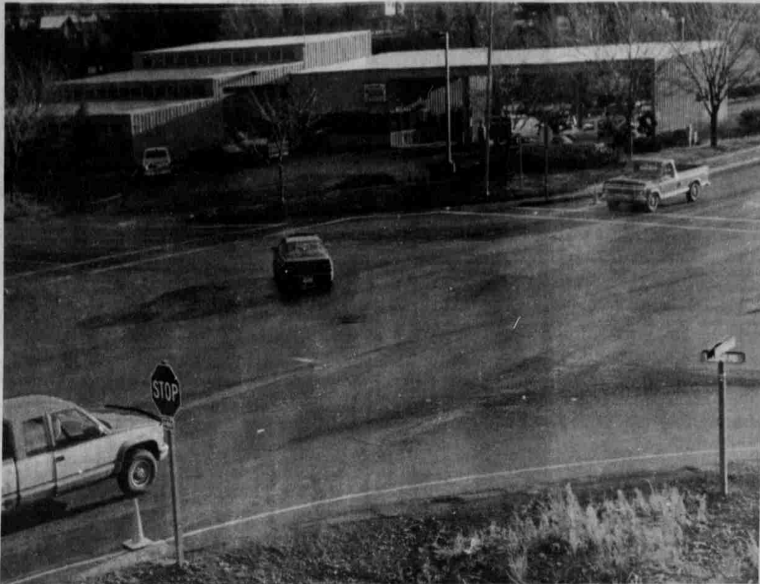
Four-way stop in effect at the intersection of Hollywood and Tenino to assist in the congestion of traffic during the rush hour.