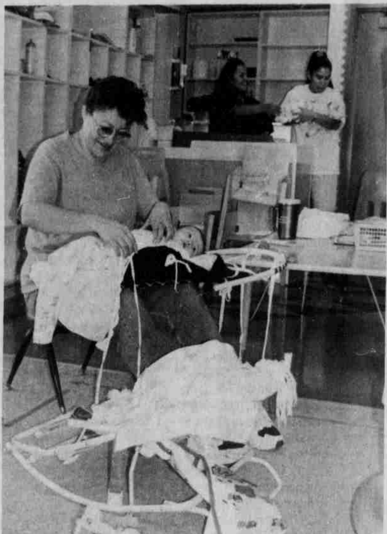
Early Childhood Education opens new infant center for the overwhelming amount of infants born this year.