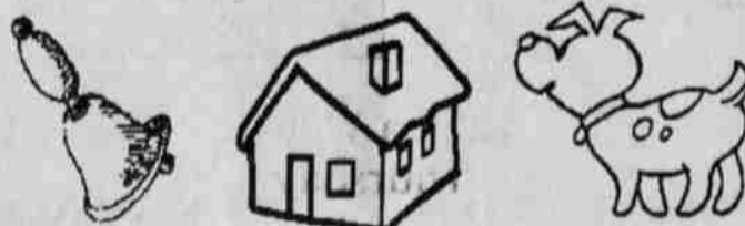
Kw'alál kw'alal (bell)